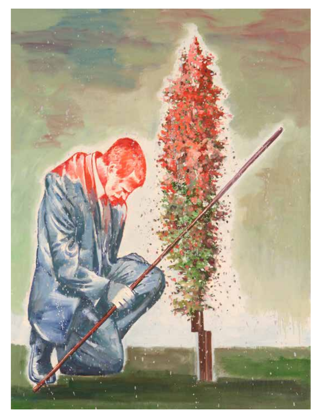
NICKY NODJOUMI, HOW TIMES CHANGE (2015), OIL ON CANVAS, 40 X 30 INCHES