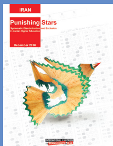
Punishing Stars: Systematic Discrimination and Exclusion in Iranian Higher Education