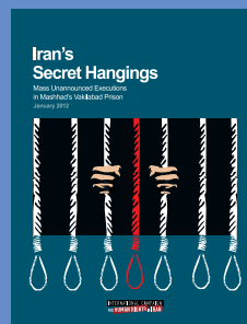
Iran's Secret Hangings: Mass Unannounced Executions in Mashhad's Vakilabad Prison