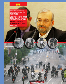
Official Distortion and Disinformation: A Guide to Iran's Human Rights Crisis

INTERNATIONAL CAMPAIGN FOR HUMAN RIGHTS IN IRAN