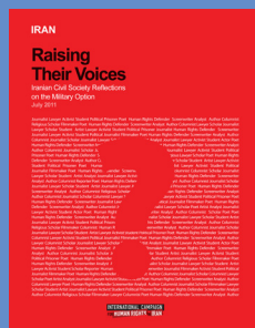
Raising Their Voices: Iranian Civil Society Reflections on the Military Option