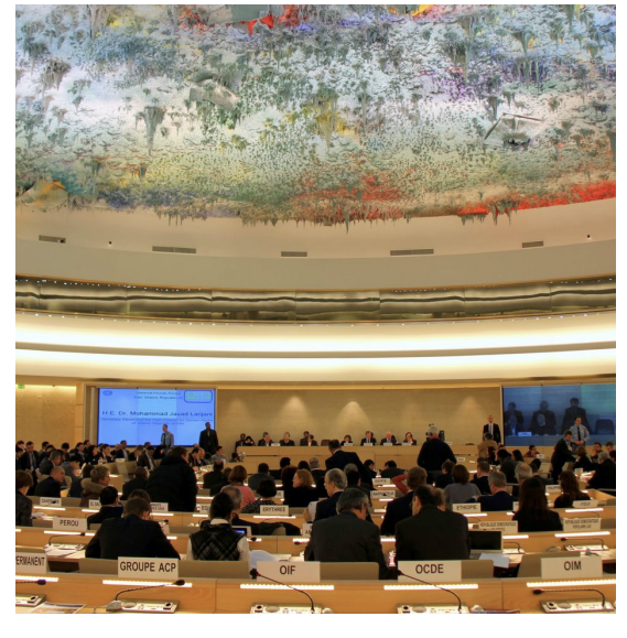
Human Rights Council during Iran's Universal Periodic Review, February 2010

Furthermore, in December 2010, the U.N. General Assembly's resolution on human rights in Iran noted that Iran "has left unanswered the vast majority of the numerous and repeated communications of [the] special mechanisms."<sup>3</sup>