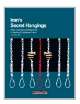
Iran's Secret Hangings: Mass Unannounced Executions in Mashhad's Vakilabad Prison