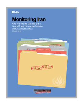
Monitoring Iran: One Year into the Mandate of the Special Rapporteur on the Situation of Human Rights in Iran