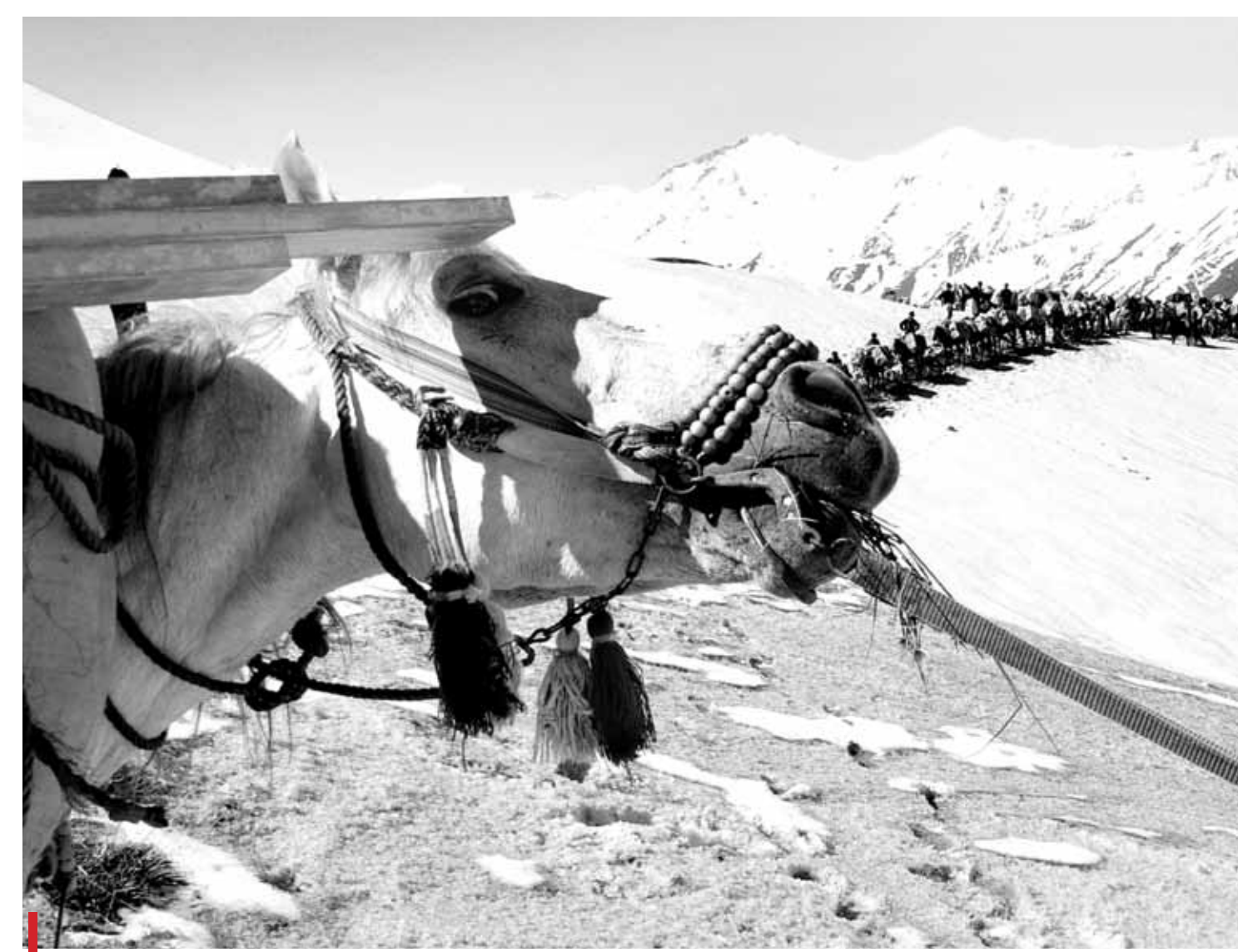
"Several of my friends, who were their families' breadwinners, were killed by the police and military forces.... The people of this region have no other option of employment. They are taking risks with their lives in order to feed their families." — a kulbar from Baneh, in an interview with the International Campaign for Human Rights in Iran