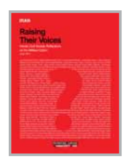
Raising Their Voices: Iranian Civil Society Reflections on the Military Option